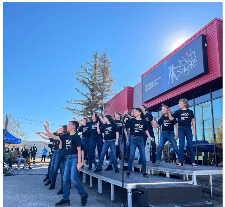
APAC Building Naming & Ribbon Cutting Ceremony Images