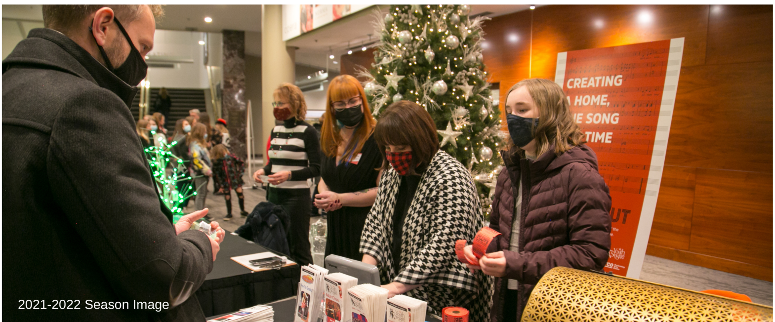
2021-2022 Season Image

Thank you to all the volunteers, council, and department leadership for all the help and supporting our singers as we navigated this season.